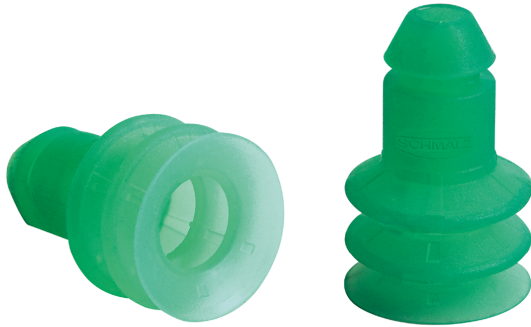
Bellows Suction Cups SPB2 P (2.5 Folds)