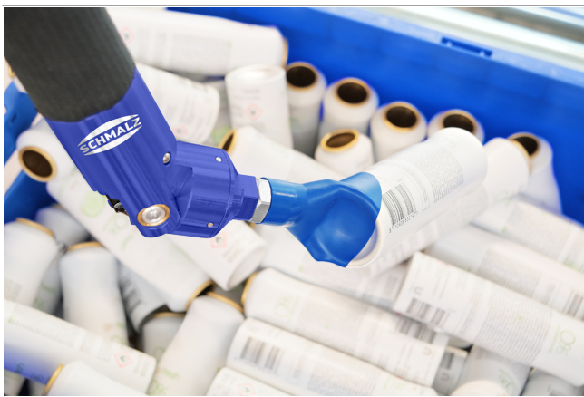
Bin-picking suction cup SVE for removing spray cans from a box