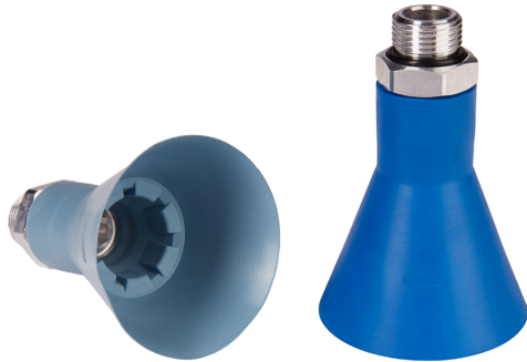
Bin-Picking Suction Cups SVE