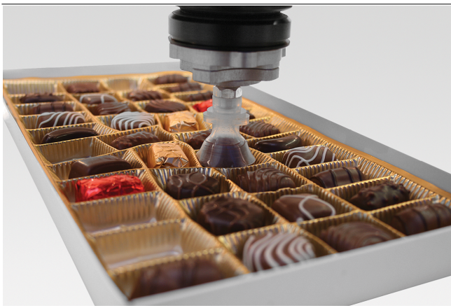
Chocolate suction cups SPG being used for handling chocolates