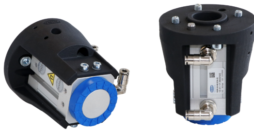
Handling Sets SGM-SV