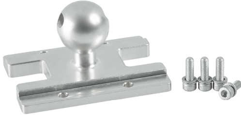
Holder System Magnetic Grippers SGM-HP/-HT (multiple)