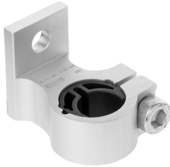
Holders for Sensors HP-SE