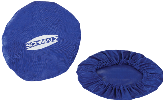
Protection Covers PC