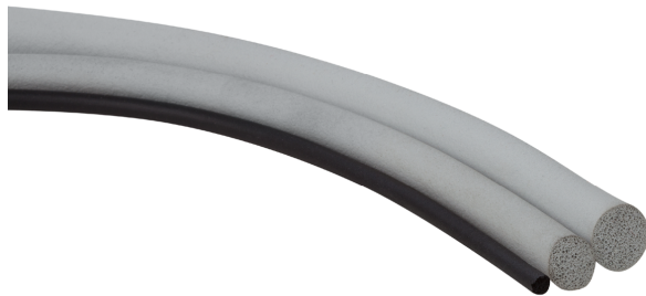
Sealing Cords DI-SCHN