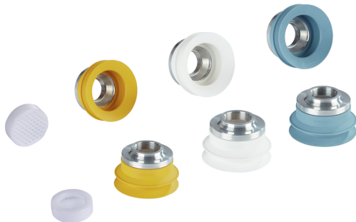
Suction Cups for Flow Grippers SCGS