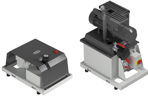
Vacuum Units VH-OG Start

Suction rate 10, 21, 40, 63 and 100 m 3 /h